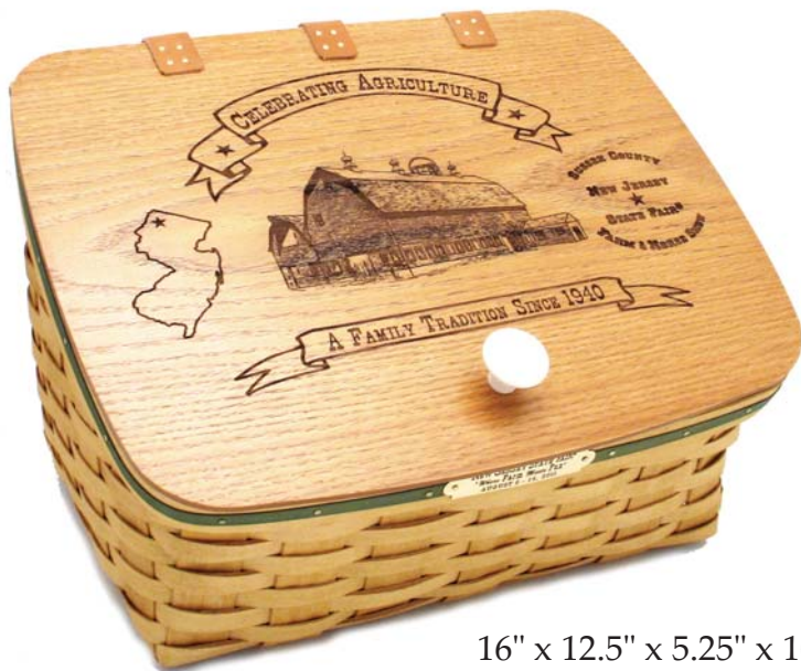
16" x 12.5" x 5.25" x 10.75"

A commemorative brass plaque will be proudly displayed on your Limited Edition basket.